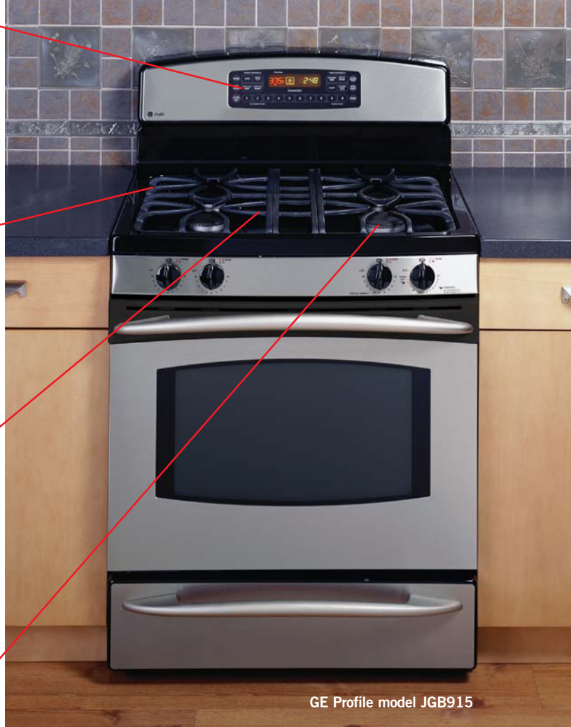
GE Profile model JGB915

Elegant contoured shape gives the range sophisticated appeal.