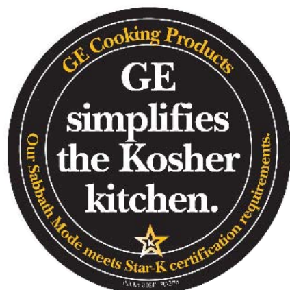
Pub. No. 3-D241