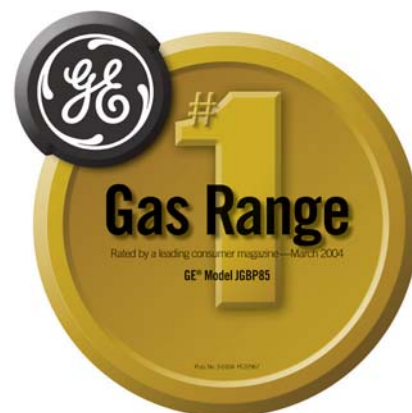
Model JGBP85 Pub. No. 3-D104