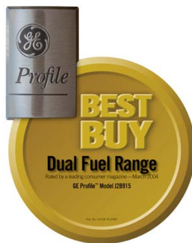
Model J2B915 Pub. No. 3-D104