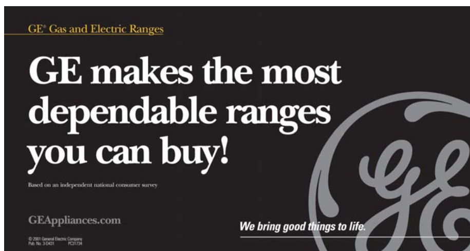
Pub. No. 3-D431