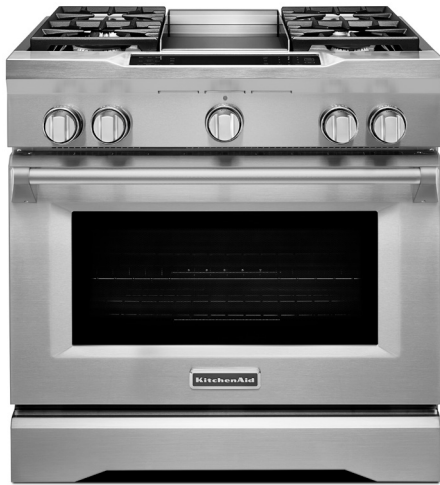
Stainless Steel KDRS463VSS