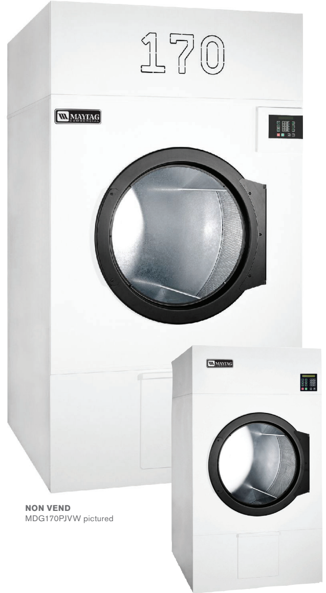
NON VEND MDG170PJW pictured