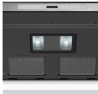
Easy-to-access, sliding grease filters allow for effortless, hassle-free replacement