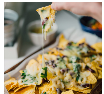
Melt/Soften feature to quickly melt butter, soften ice cream, and warm syrup

Product specifications and design are subject to change without notice.