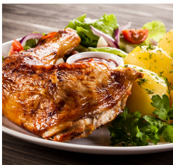
Generous, 1.4 cu. ft.* oven makes it easy to reheat larger dishes

The powerful, 2-speed ventilation system is effective up to 300 cu. ft. per minute (300 CFM) and can be configured to ducted venting or ductless recirculation. The SMO1461GS also features easy-to-reach, easy-to-replace charcoal, and grease filters. With decades of experience designing innovative cooking appliances, it's easy to see why cooks around the world trust Sharp.