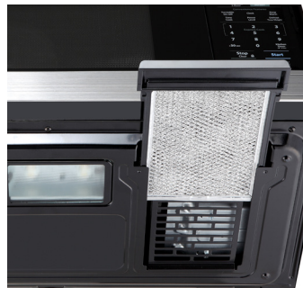
Easy-to-access, sliding grease filters allow for effortless, hassle-free replacement