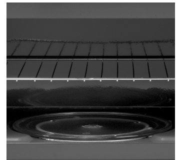
Recessed turntable with On/Off functionality creates an even cavity floor to accommodate cookware as large as 14" x 20"

Product specifications and design are subject to change without notice.