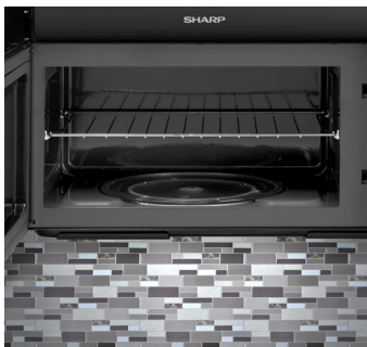
Chrome grill rack accessory included for multi-level cooking and reheating

The powerful, 3-speed ventilation system is effective up-to 450 cu. ft. per minute, and features easy-to-reach, easy-to-replace filters. The Simply Better Clean enamel coating inside the oven is stain resistant and wipes clean with a damp cloth. With decades of experience designing innovative cooking appliances, it's easy to see why cooks around the world trust Sharp.