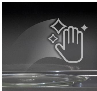
The Simply Better Clean interior provides a stain-resistant and easy-to-clean interior